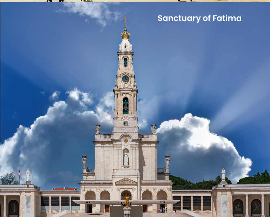
Sanctuary of Fatima